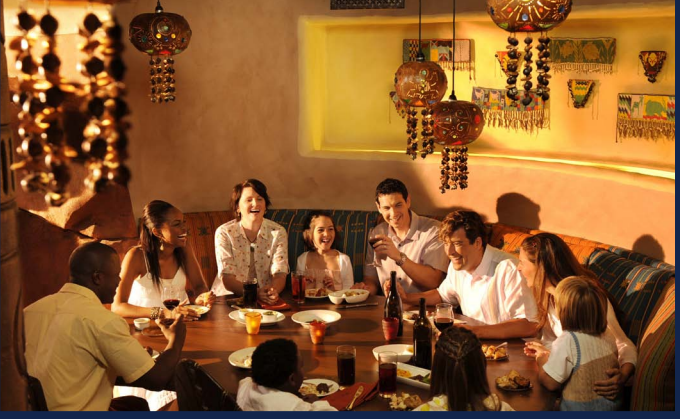
Sanaa at Disney's Animal Kingdom Villas - Kidani Village